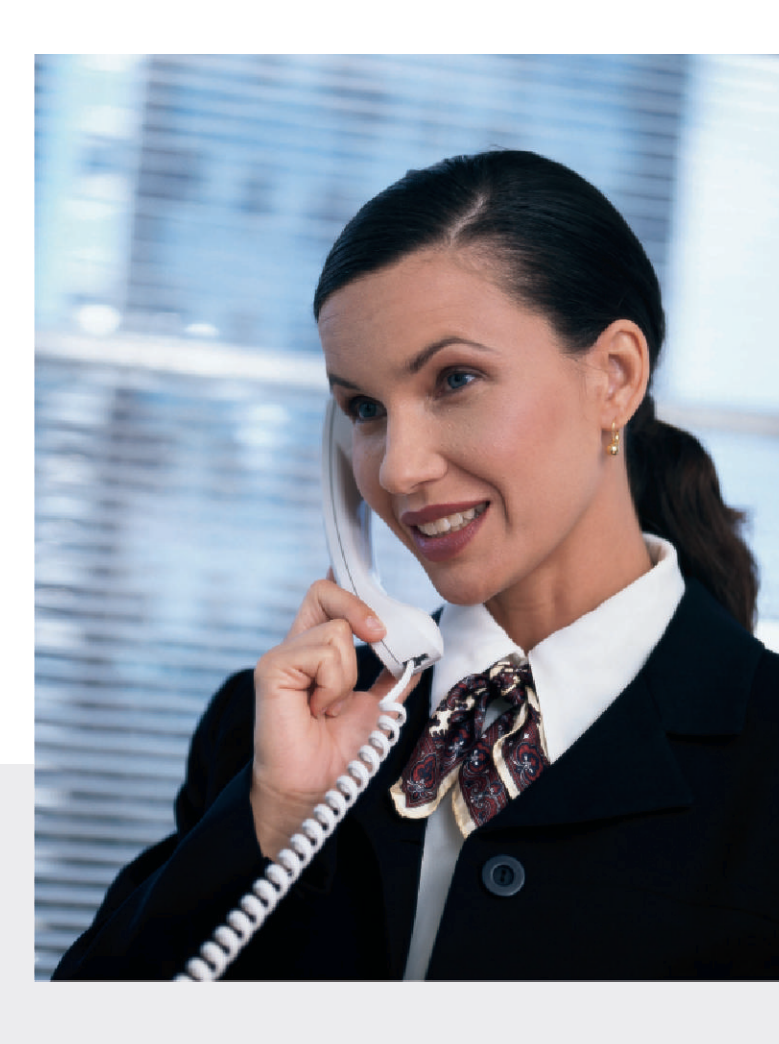
COSINE Digital ISDN Key Phone System